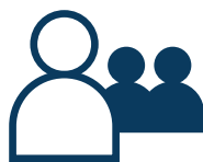
One trusted partner